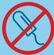
Feminine hygiene products