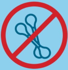
Cotton (Cotton swabs or balls)