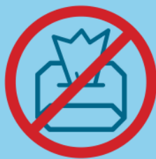
Wipes (Baby or flushable)